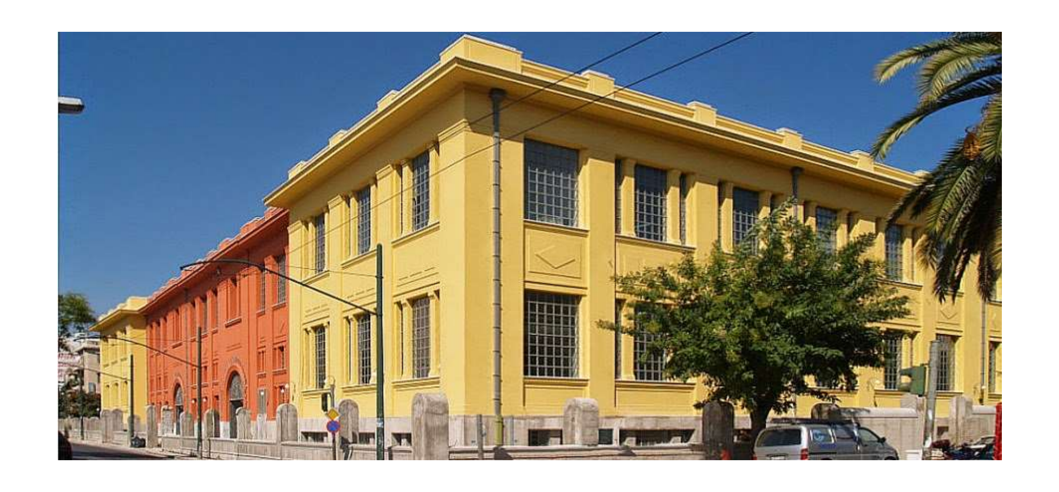
The Old Tobacco Factory, 218 Lenorman Str.