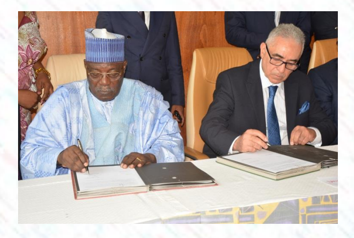
Signing of partnership convention