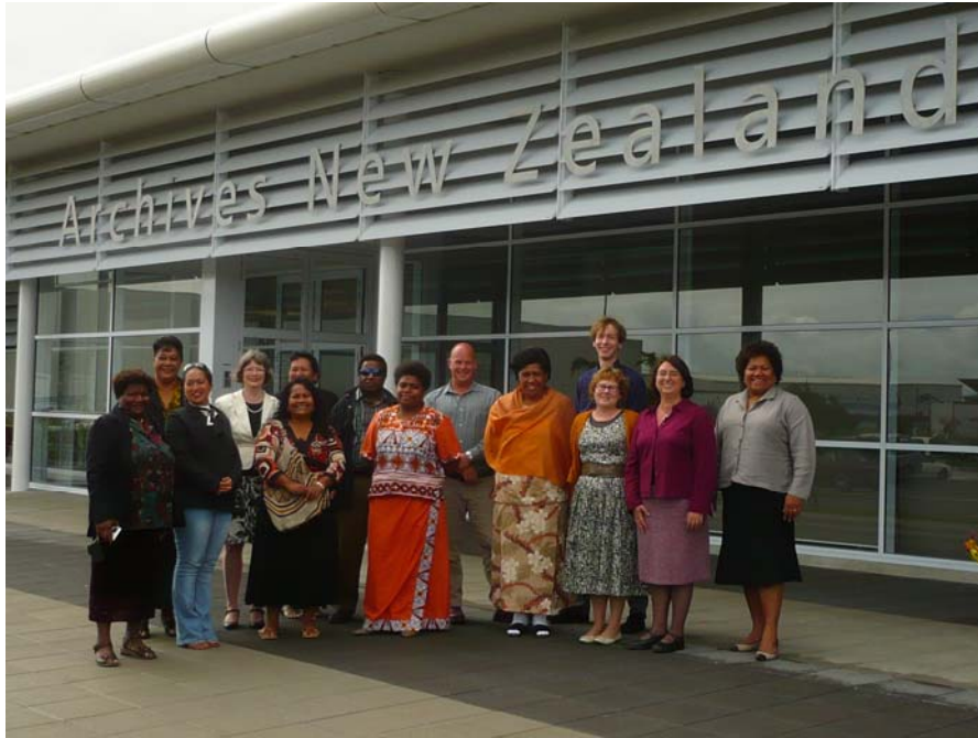
Toolkit Reference Group outside Archives New Zealand, December 2008