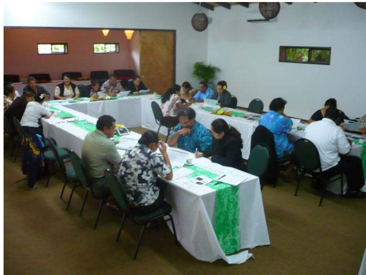
In-country training using the Toolkit. Cook Islands, 2009

While using AusAID and NZAID money to fly trainers from Australia around the Pacific is very useful, it is not a sustainable way to address the underlying challenge of information management capacity over time. PARBICA is of the view that the Toolkit can only be sustained if each member country develops its own training courses and has the internal capacity to deliver those training courses to government agencies. To that end Guideline 11 of the Toolkit is important, as it is a Train the Trainer guide for PARBICA members and others wishing to develop and deliver their own in-country training courses on good records and information management.