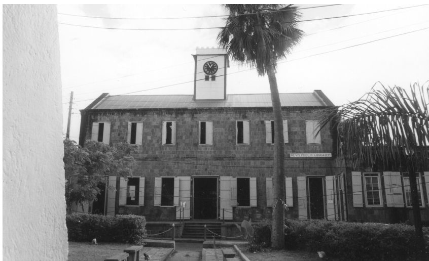
The Public Library of Nevis (Saint Kitts and Nevis) in the Caribbean, which sent a contribution to IFLA's Core Activities fund in 2001.