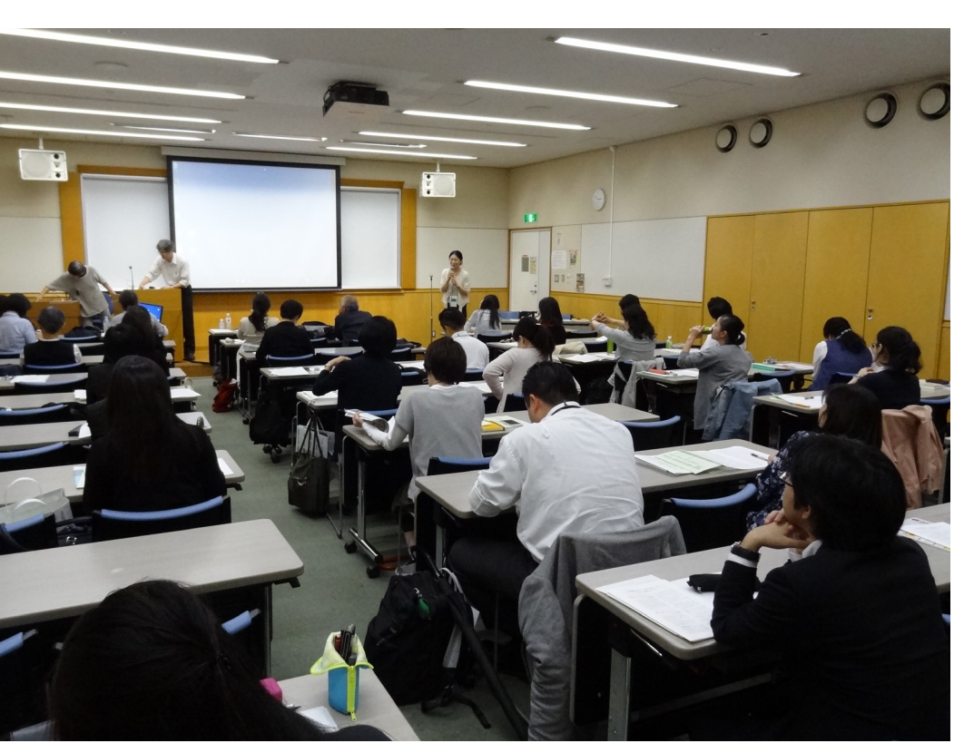
103rd All-Japan Annual Library Meeting in Tokyo

After having the two meetings, we learned that some libraries in Japan were proceeding multicultural library services, however many libraries were struggling for what to do. We are planning to publish a Q and A book in next year to help those libraries.