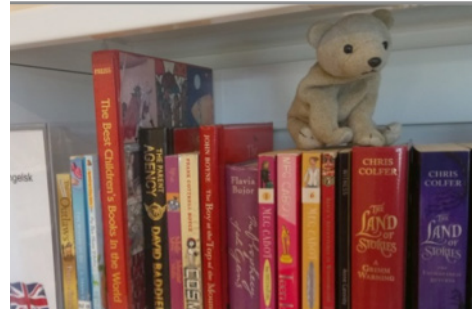
Mrs Appleby's travelling companion never missed an opportunity to look at the foreign language collection.