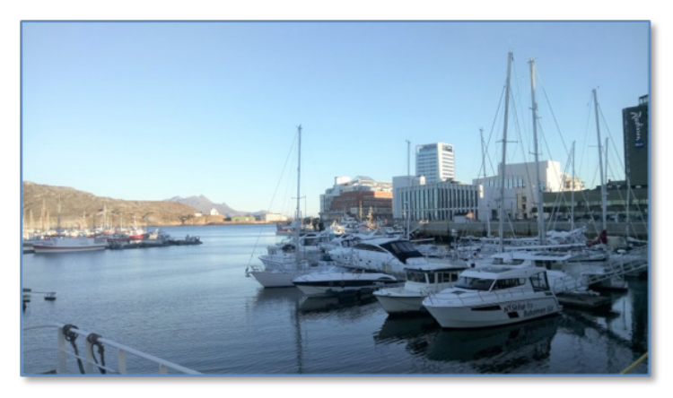
Norway: Bodø Library, Stormen Biblioteket; right beside the harbour, on a perfect October day above the Arctic Circle