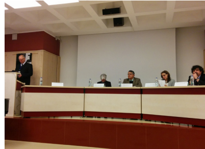
Romanian organising committee