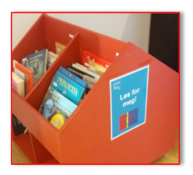
Bodø library: book box promoting the indigenous language Lulesami to familes. Bodø also accommodates a Lulesami playgroup.