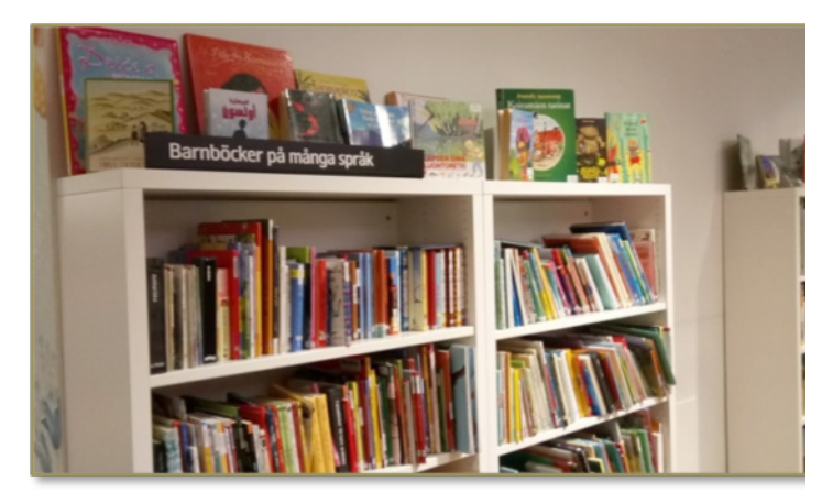
Kista's children's library (Barnbiblioteket) offers 'books in many languages.'

Reflecting Stockholm's pervasive (and very impressive) environmental policy, a Readcycling bin sits in the foyer of Stockholm's City Library. Nearly all of Stockholm's 40 libraries have these, where borrowers can help themselves to an extra read, and donate what they have finished with. It's very popular, doesn't detract from what the library has to offer.