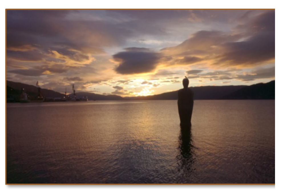
Mo-i-Rana's answer to the Angel of the North: the 'Man from the Sea.'