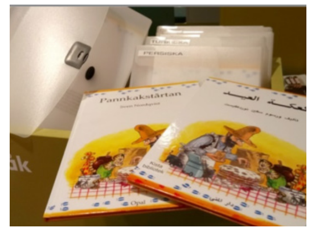
They demonstrate another practical way to offer dual language resources: one of each.