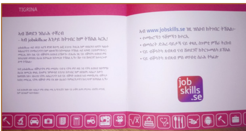
They also partner with the job centre to provide information in home languages