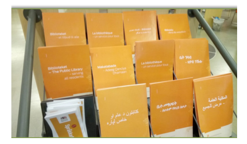
Leaflets in a variety of languages are right at the entrance, welcoming all local residents to their public library.