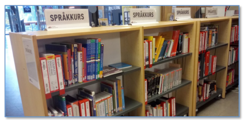
See Reflection in Pictures, page 14...