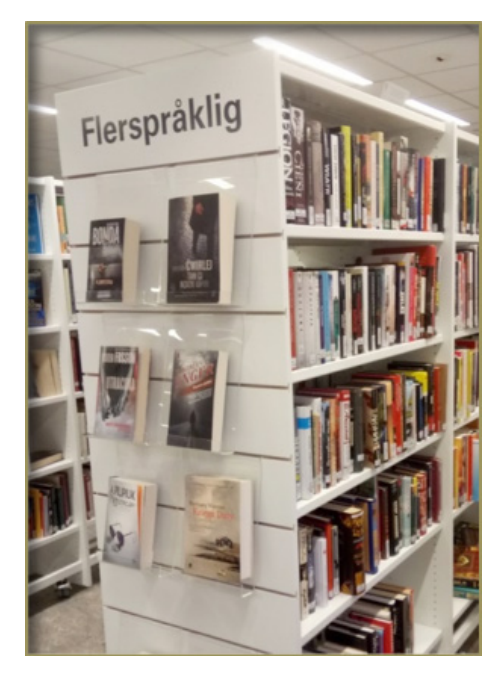
The multilingual collection at Mo-i-Rana town library – no official visit here; we just popped in.

Chaos storage; it doesn't matter which box the book goes in; it's all done by barcode. Apparently a team from the British Library came here to see how it was done. Superefficient, and exciting to watch. Noisy: the workers need earmuffs. Everyone in the team takes a turn checking books in and out, including the managers.