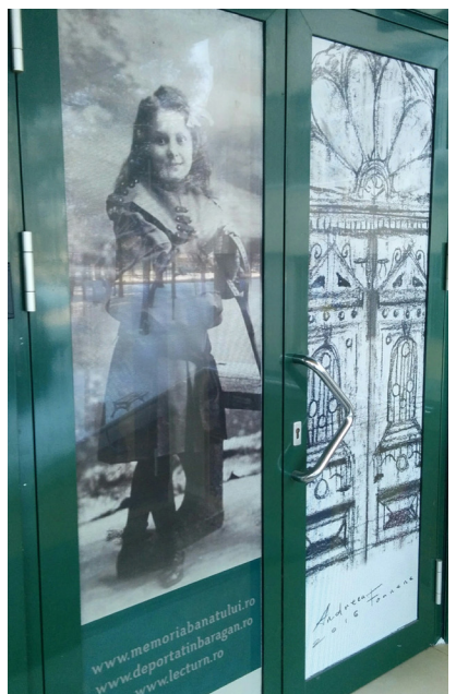
Entrance to Eugen Todoran Library

The conference ended with a historical city tour, looking at examples of multiculturalism reflected in architecture and urban design across the city centre.