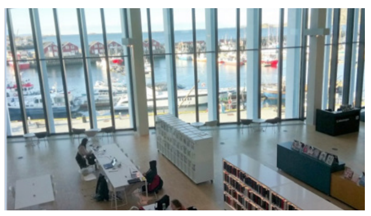
Who wouldn't mind working here?