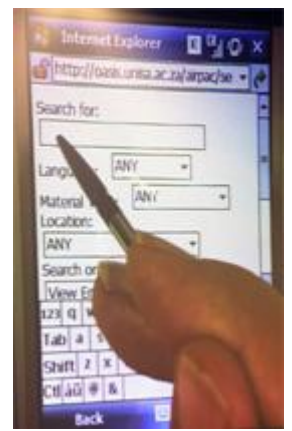
AirPAC being demonstrated