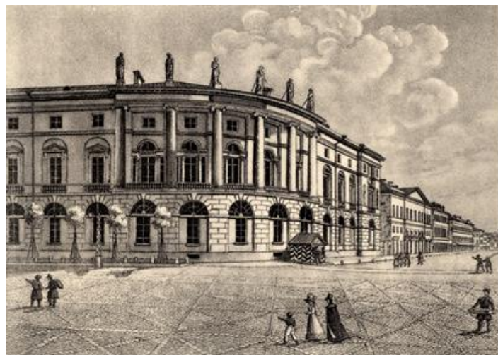
The building of the National Library of Russia. St.-Petersburg. XVIII century.