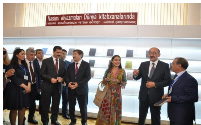
From the opening ceremony of the exhibition "Nasimi manuscripts in world libraries"

Within the framework of the conference, the Minister of Culture of the Republic of Azerbaijan Abulfas Garayev and Vice-President of the Heydar Aliyev Foundation Leyla Aliyeva solemnly opened the exhibition "Nasimi Manuscripts in the world libraries" in the National Library of Azerbaijan with the participation of representatives of the National Libraries of 14 countries. This exhibition featured 32 copies of Nasimi manuscripts and digitized copies from Turkey, Iran, Czech Republic, Egypt, Bosnia, and USA in the Turkish, Arabic, and Persian languages.