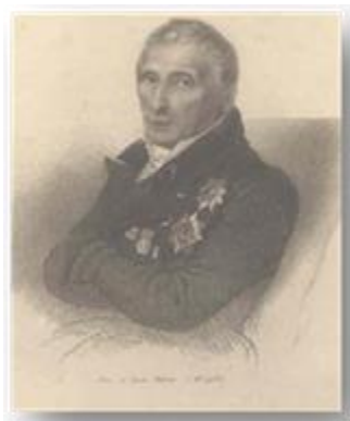
Mr. Olenin – the 1st director of the Imperial Public library (now - the National Library of Russia)

Already in 1808 the director of the Imperial Public library (the previous name of the National Library of Russia) Mr. Olenin, created the first Russian Guide of organizing funds and catalogs, and also developed a classification that became not only the basis for organizing funds and first catalogs, but also the structure of the Imperial Public library in the 19th century. This structure of our library, with a number of changes, lasted until a major reorganization in 1930.