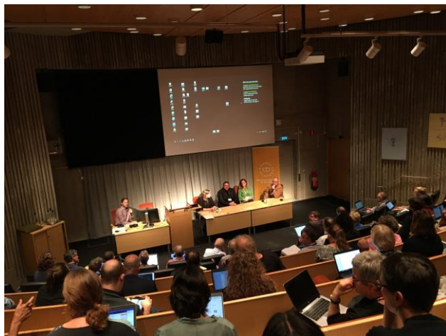
Panel discussing Relationships. Osmo Suominen is moderator.