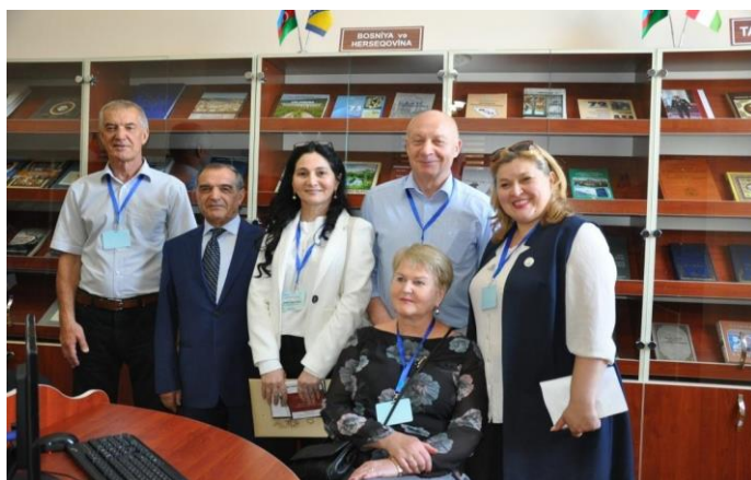
The International Cooperation Hall

Additionally, the opening of the "International Cooperation Hall" included permanent literary corners of 14 countries within the framework of the conference, held at the National Library with the participation of ambassadors and the heads of the National Libraries from 14 countries. The opening of this hall will allow for the establishment of closer ties between libraries and the expansion of information exchange.