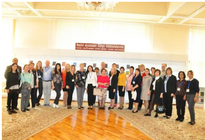
Conference participants in front of an exhibition "Nasimi manuscripts in world libraries"

Additionally, the opening of the "International Cooperation Hall" included permanent literary corners of 14 countries within the framework of the conference, held at the National Library with the participation of ambassadors and the heads of the National Libraries from 14 countries. The opening of this hall will allow for the establishment of closer ties between libraries and the expansion of information exchange.