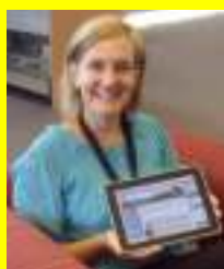
Is that an iPad?