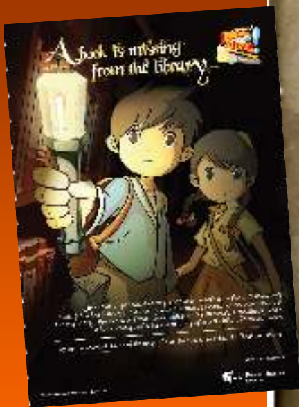
Code RE(a)D Challenge