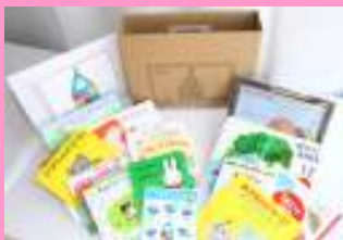
Japan's Mini-Library Project