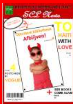
Cover: Poster by Public Libraries of Netherlands