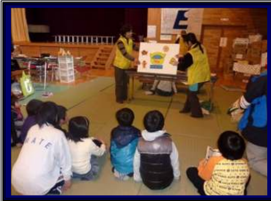
Story hour by JLA weekend volunteer teams