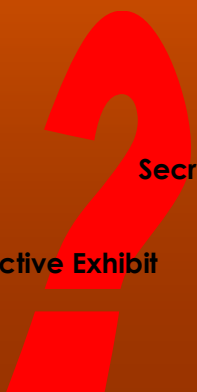
Secret Writing =>