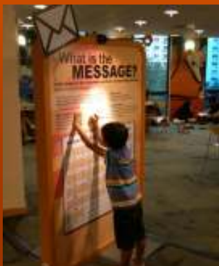
<= Interactive Exhibit

During the June school holidays, kids attended BCA specials that included hands-on experiments and games where they learnt more about crime solving, ancient civilisations, and secret codes amongst others. The content was created by NLB's own children's librarians, with sessions targeted at the seven to nine and ten to 12 age groups. Book Sharing formed part of the programmes and the response was positive. Many of the kids who attended these sessions stayed back to learn more about the topic and to borrow the books put on display.