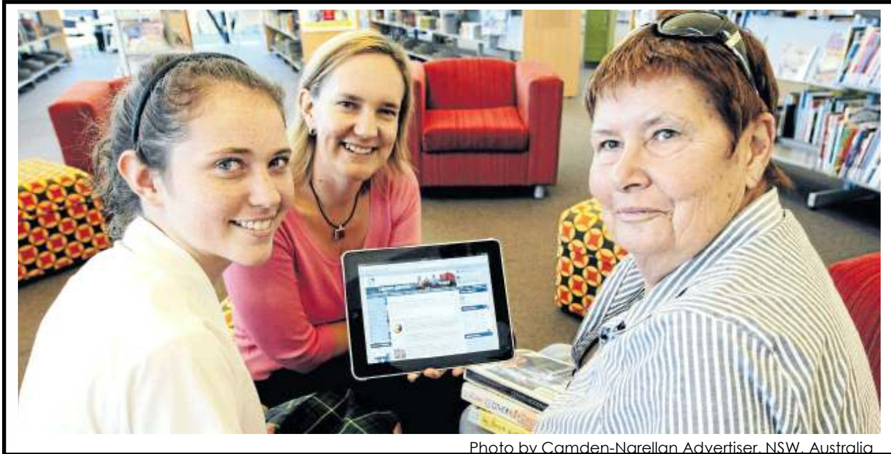
NSW, Australia

Camden Council's Libraries, in NSW, Australia have introduced Book-a-Librarian on Monday afternoons at Narellan Library. One of the Youth Services Librarians provides an additional reference inquiry point for High School students at the beginning of the week when Homework and assignments loom large. From 3.00-4.30 pm, blocks of time can be booked or accessed as needed.