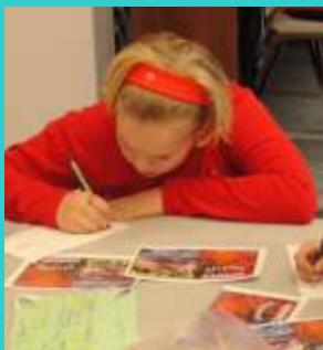
Postcards to the world