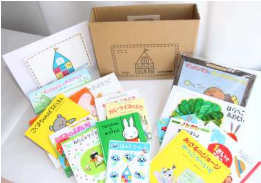
"UNICEF Children's Mini Library" project - a book set for babies and toddlers