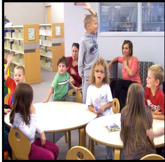
We all have suggestions!