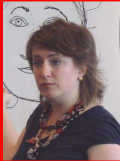
2010 ALMA winner