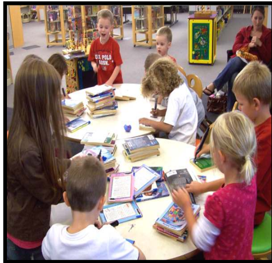
Helping to discard books.