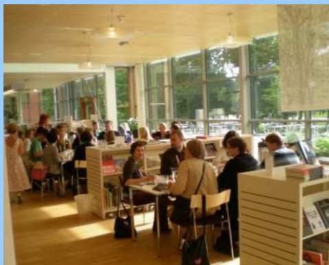
Tea at the Library

At the library, one could see school librarians at cool mini stations whom students can approach to get help from. These school librarians also conduct many programmes during school term time at the school which is just across the street. All participants were also treated to an elaborate tea at the library cafeteria where library users could eat, drink and read from the numerous magazines the library had subscribed.