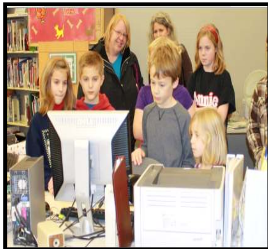
Viewing the tweens' library video