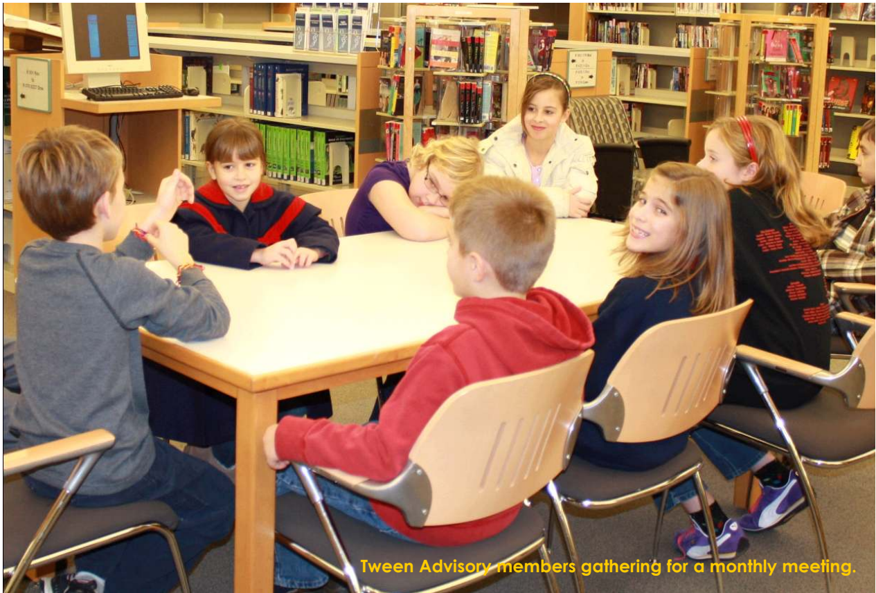
Tween Advisory members gathering for a monthly meeting.

If you listen to a child's opinion, he's sure to tell his friends you paid attention. When you act on the information he provides, you are sure to be swamped with more ideas. Acting on this landslide of shared thoughts will hopefully get you "playground credibility." These are the operating principles that form the basis of the two advisory groups that guide the Children's Department of Madison Public Library in Madison, Ohio. Children ranging in age from four through thirteen are divided into two groups and meet once a month to accomplish a variety of things. Even though these handpicked groups have only been in existence since August 2010, they have already made their mark on the library.