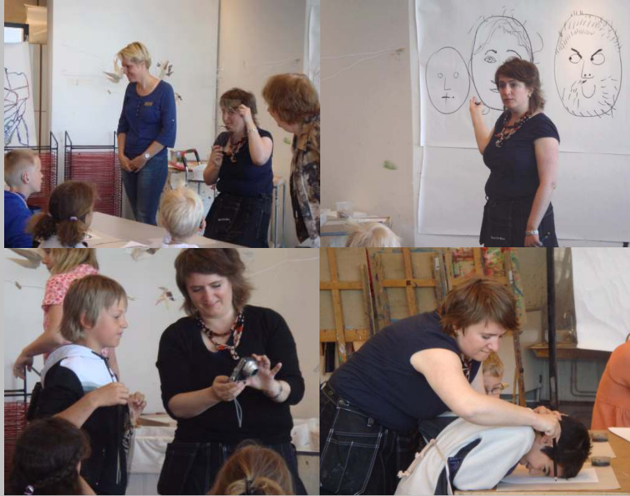
Kitty Crowther conducting a workshop on illustration for children.

At the end of spring, the award winner visits Sweden and sometimes other countries for about a week. This week is very intense and full of activities like seminars, workshops and meetings with colleagues and children, politicians and journalists, librarians and promoters of reading. Schools are involved and competitions for pupils with focus on literature reach the peak during this week. The winner this year, Kitty Crowther, conducted some very popular and inspiring workshops for children at the Art Studio of Kulturhuset, where I work. She showed the children how to make portraits, using a unique technique with ink, cotton buds, colour pens, overhead sheets and sheets of paper.