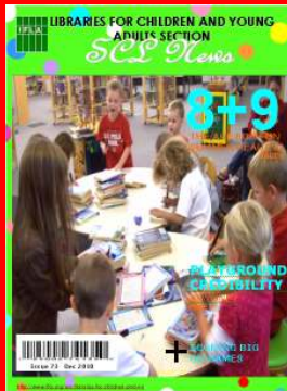
Cover: Little advisors at Madison Public Library, Ohio, USA