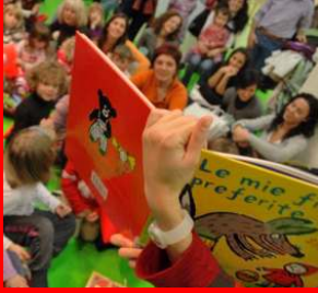
A helping hand