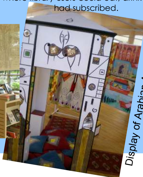
Display of Arabian Artifacts