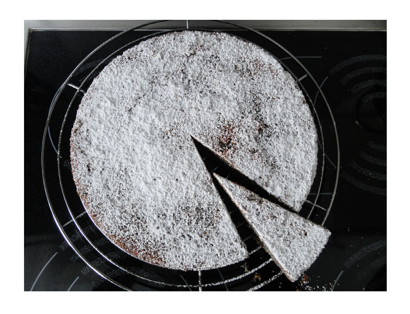
SHARE. RESOURCES. FREELY.