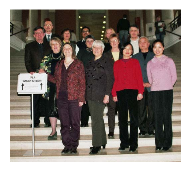
The Standing Committee Member – staircase of the Bavarian State Library