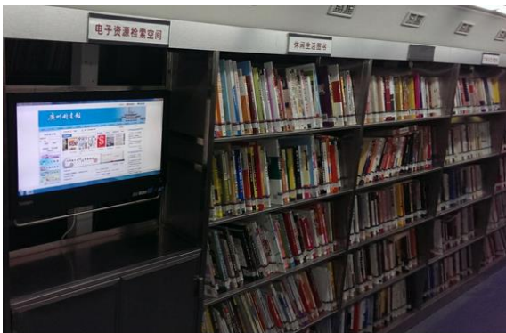
(Inside the bus upgraded in 2011, with self service machine in forepart and computers in rear.)