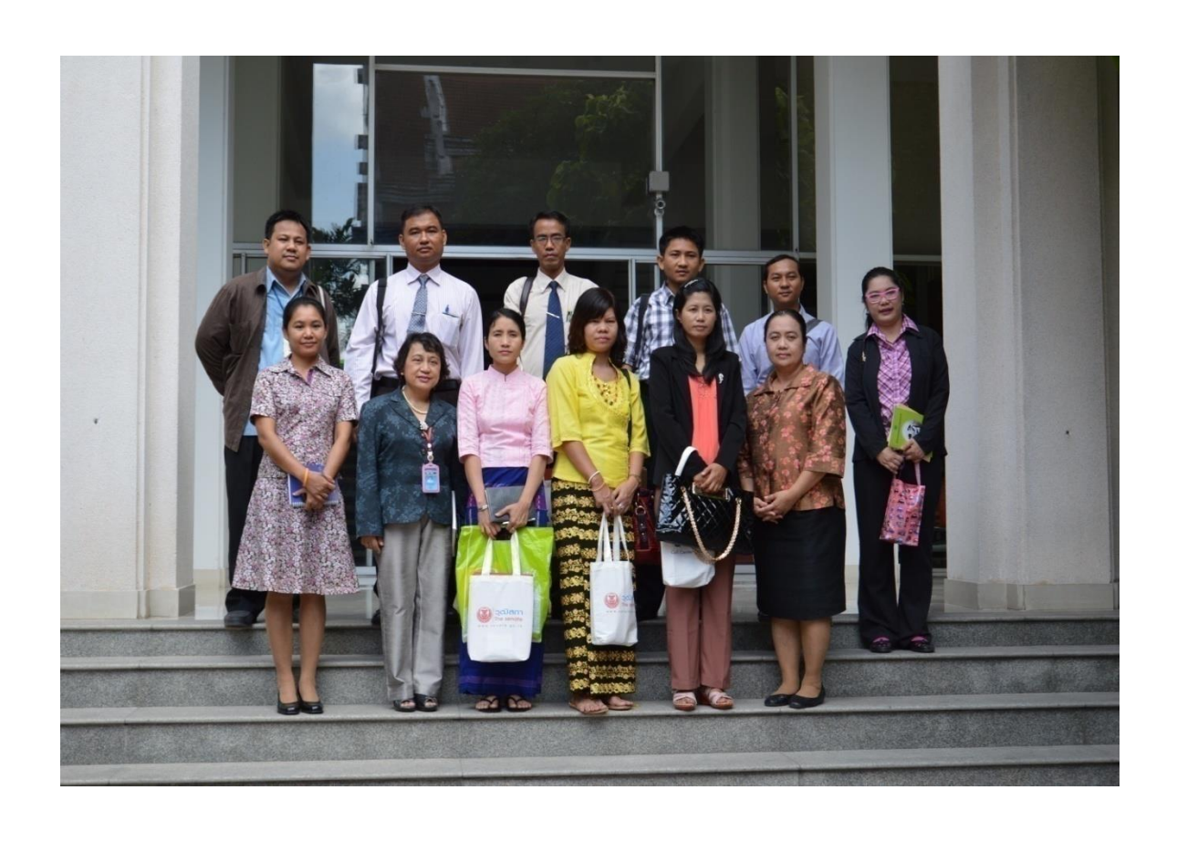
13. Site Visit Library and Archives of the Bank of Thailand