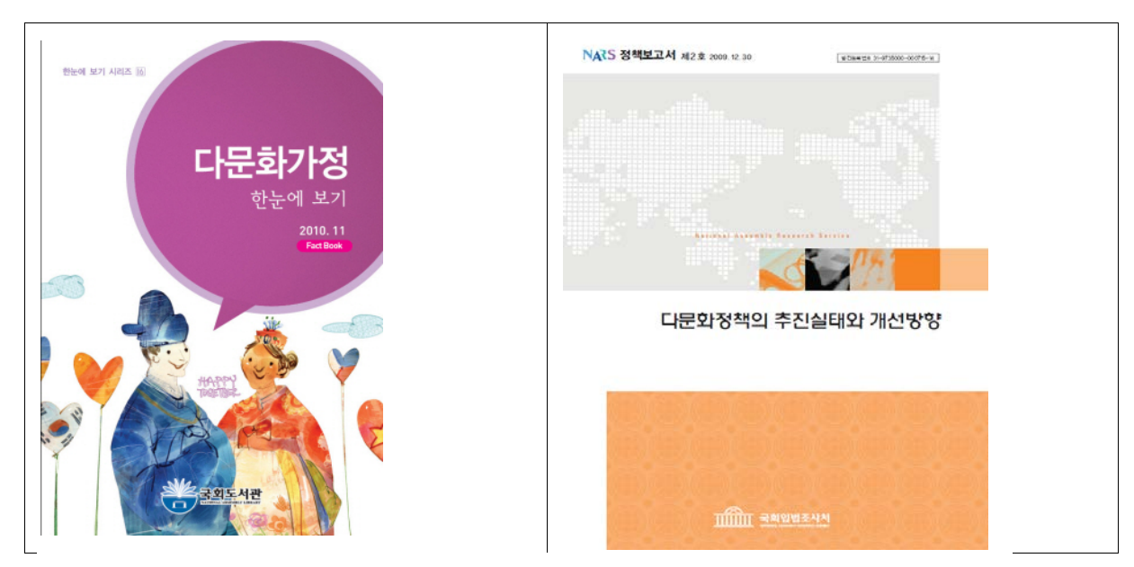
Figure 2: Cover pages of the Fact Book and the Policy Report on "multiculturalism"

As of February 2014, the Fact Book has published a total of 42 volumes, and the Policy Report has published 30 volumes. With regard to these volumes, three topics from the Fact Book and four from the Policy Report were partly (or in whole) similar.