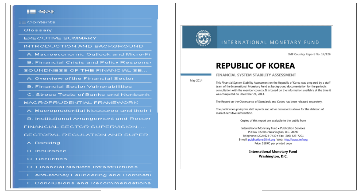
Figure 1: Contents of current main policies