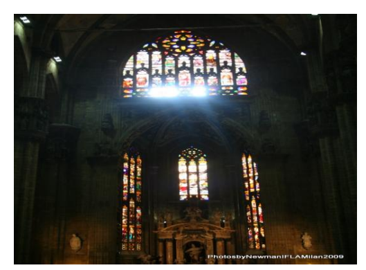
Inside Duomo, Milan

were events open for delegates, including a concert for piano and Stradivari violin, at Duomo, Milan ["Stradivari instrument" 'Marechal Berthier 1716 ex Napoleon' with kind permission of Pro Canale Foundation"]; Palazzo