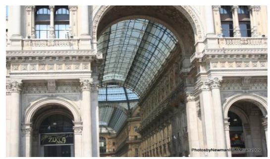
Galleria Vittorio Emanuele II

The main event: Milan outdid itself with the "Social Evening at the Galleria Vittorio Emanuele II." At first note one could be skeptical of how