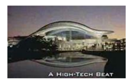
IFLA 2011 - Puerto Rico

For a short video introduction to San Juan and Puerto Rico, please visit this YouTube link: