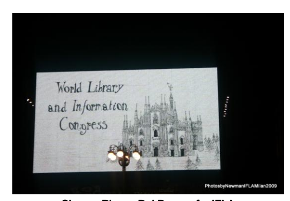
Sign on Piazzo Del Duomo for IFLA

This was a first, but something says, it will not be the last. A fantastic evening, leisurely and incredibly fulfilling.