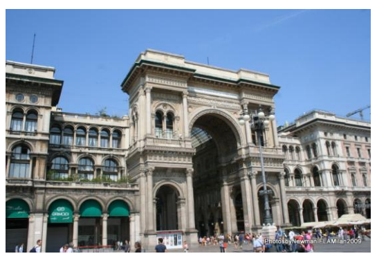
Galleria Vittorio Emanuele II, Piazzo Duomo

The primary program for the Social Science Libraries Section "The convergence of the social science libraries with libraries, archives and museums in preserving cultural heritage," addressed the role of social science knowledge and libraries, the world digital library, conservation of heritage and cultural development of Latin America and the Caribbean, and the European perspective.