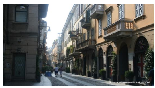
Typical street for al fresco dining

well this would be pulled off. A major center of the city completely open to everyone, and IFLA delegates finding their way to restaurants, listed in the invitation, for dinner, Additionally, there